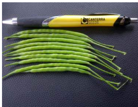
Very long and big pods