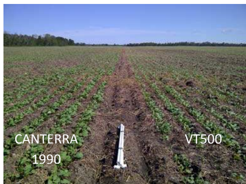
Early season vigor